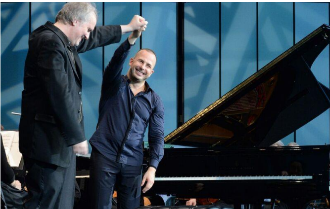
Yannick Nézet-Séguin and Nicholas Angelich