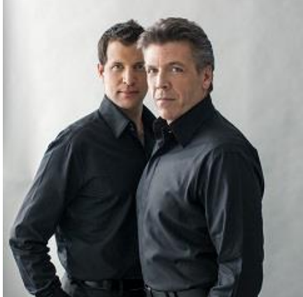
Thomas Hampson and Luca Pisaroni