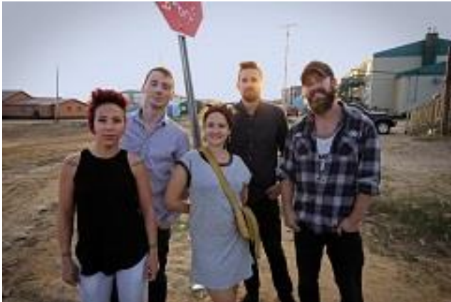
The Jerry Cans