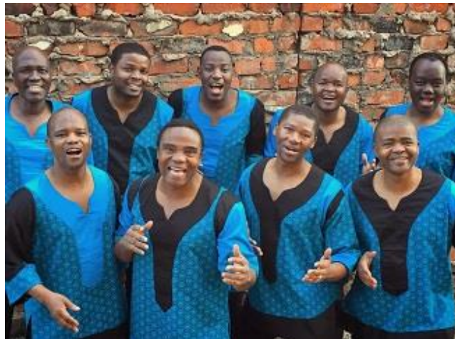
Ladysmith Black Mambazo