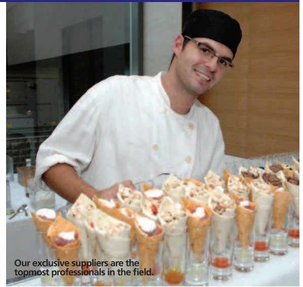
Our exclusive suppliers are the topmost professionals in the field.

Emblem Fiori Forget Me Not Flowers Terrain Flowers Stemz Cool, Green and Shady