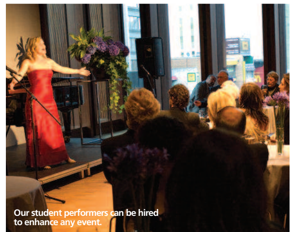
Our student performers can be hired to enhance any event.