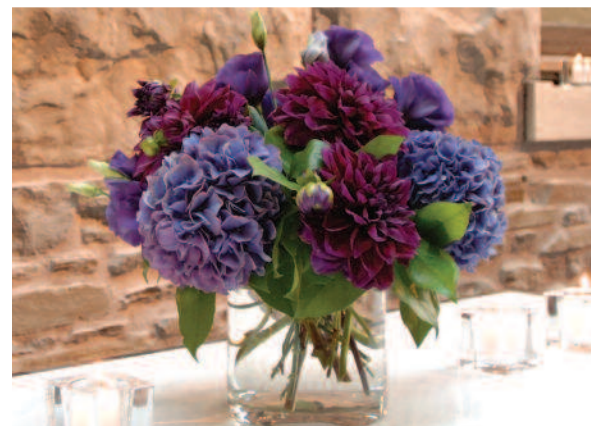
Our attention to detail makes every presentation or event perfect.