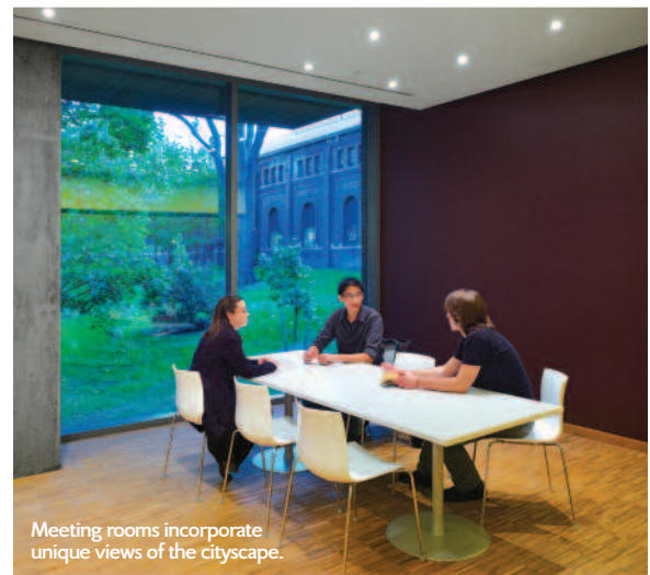
Meeting rooms incorporate unique views of the cityscape.