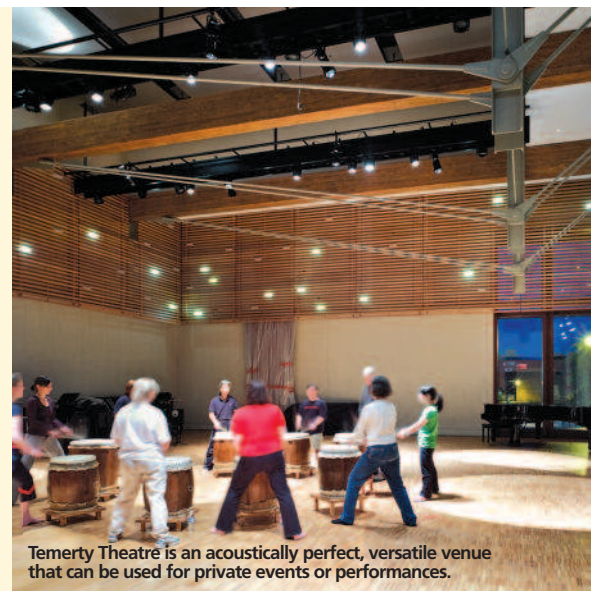
Temerty Theatre is an acoustically perfect, versatile venue that can be used for private events or performances.

"HONEY-COLOURED OAK DOMINATES THE INTERIOR, FROM THE FLOORS TO THE PROFUSION OF CURVES ALONG NEARLY EVERY SQUARE METRE. THE WARM TONES ARE BROKEN UP BY UNDULATING GREY-BROWN PLASTER WALLS AND DARK-CHOCOLATE UPHOLSTERY. BUT THE REAL VISUAL WOW COMES FROM THE "STRINGS," A PROFUSION OF LAMINATED WOOD STRIPS THAT RISE UP FROM BEHIND THE STAGE TO FLOAT FAR ABOVE LIKE STREAMERS IN A BREEZE."