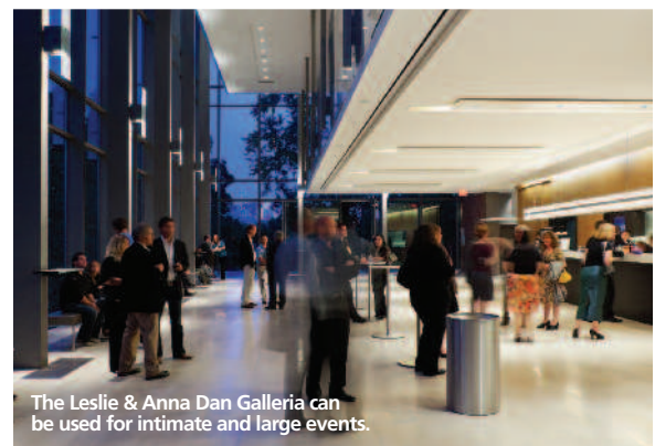
The Leslie & Anna Dan Galleria can be used for intimate and large events.