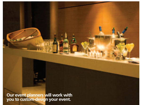
Our event planners will work with you to custom-design your event.