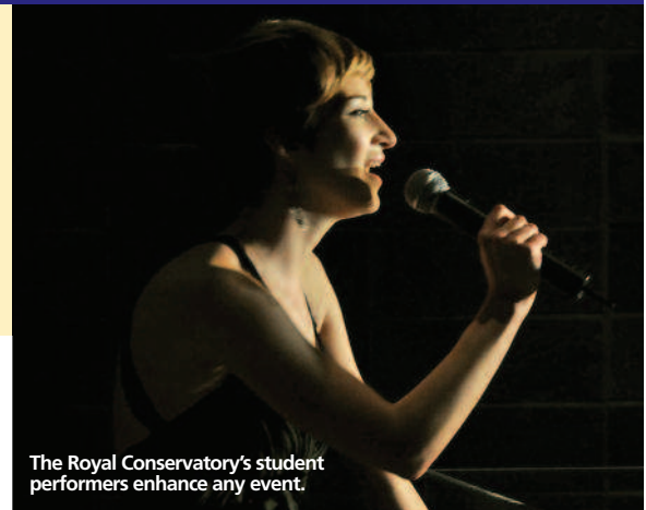
The Royal Conservatory's student performers enhance any event.

All public performances in Koerner Hall and Temerty Theatre are featured on The TELUS Centre website. Additional marketing services and inclusion in TELUS Centre marketing materials may be purchased.